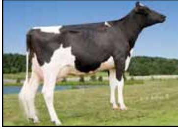
Regal Goldwyn Nicki VG-87 w/ 29500 4.4 1295F Contracted Everywhere for Embryos & Bulls. Selling her ROSS Sept Calf w/ 9 VG & EX Dams – Vanhistma

Friday March 23, 2012 11:00 A.M. EST MSU Pavillion Lansing, MI