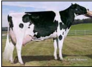
End-Road Stormatic Mabel EX-90 2E w/ 40660 & 1452F Selling a Fancy fresh LEVEL 2yr Old from her VG-86 ELEGANT w/ 36180 from a deep A.I. Cow Family that– Loew