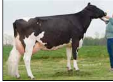
Balsy Haven Outside Magic EX-94 2E w/39720 1545F Selling her fresh ASPEN 3Yr Old, Next 6 Dams are all EX and AVG 92 Points– Balsy-Haven