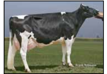
Green-Meadow Ashlynn-ET EX-92 2E EX-MS w/ 35150 & 132000+ LFT, Selling her fancy Fresh ACTIVE Hfr, and a Fresh POGO From this Family (Thor Stefanie Family)– Green Meadow