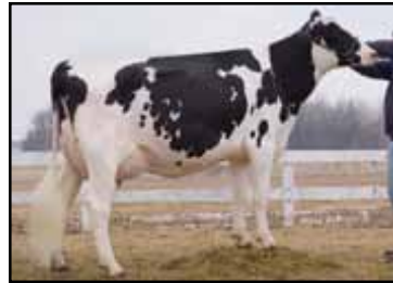
Miss Shttle Maggie Sue EX-90 EX-Ms DOM 2-3 2 365 36950 4.5 1649 Selling Her ROBUST Jan Calf backed by a great cow family