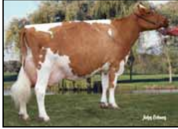
Stelbro Renita Ranger-Red EX-94 3E 4X AA R&W Selling a Sept '11 PRONTO a VG DEBONAIR, Renita is the 4th Dam on this Fancy Calf– Longhaven