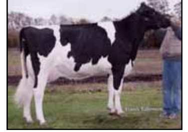
Winterfield LJ Stormy Rae-ET EX-91 EX-MS w/ 35790 4.3 1550F Selling her Dec '11 Atwood. Gr'dam is EX-92 Sweetie Rae 9 Generations VG or EX Roxy. -Winterfield